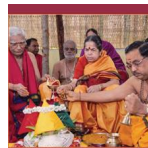
4. Religious Devotion, age 72 & onward Sannyasa Ashrama